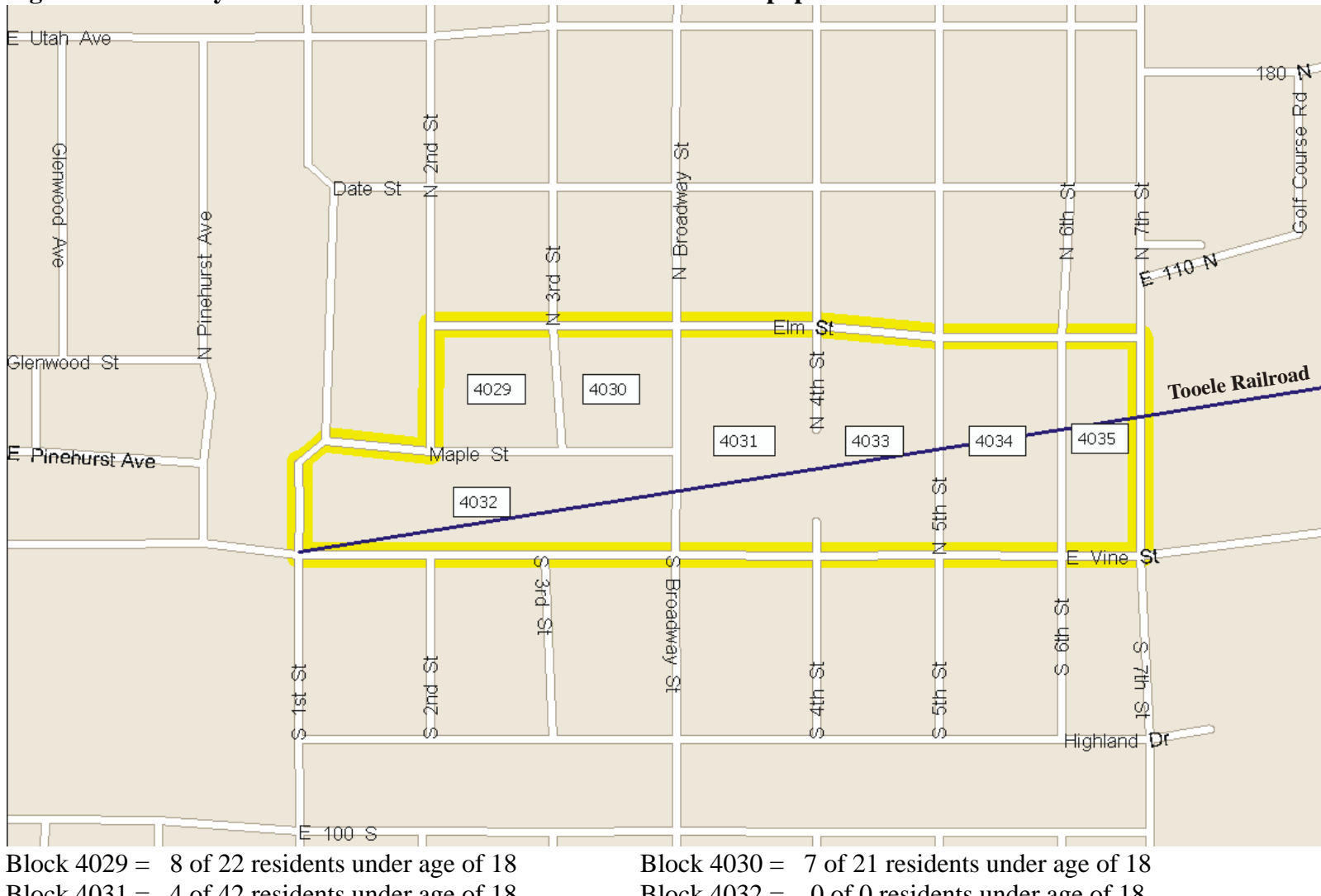
Figure 2. Boundary of on-site census blocks with 2000 census block populations.

Block 4029 = 8 of 22 residents under age of 18 Block 4031 = 4 of 42 residents under age of 18 Block 4033 = 17 of 49 residents under age of 18 Block 4035 = 9 of 26 residents under age of 18